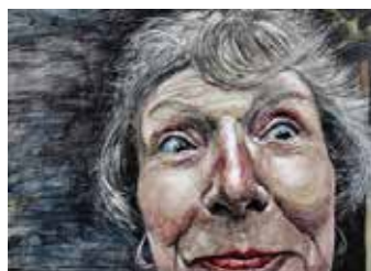
Pictured: Hey Dad, Send Me a Selfie for My New Phone and Hey Mom, Send Me a Selfie for My New Phone